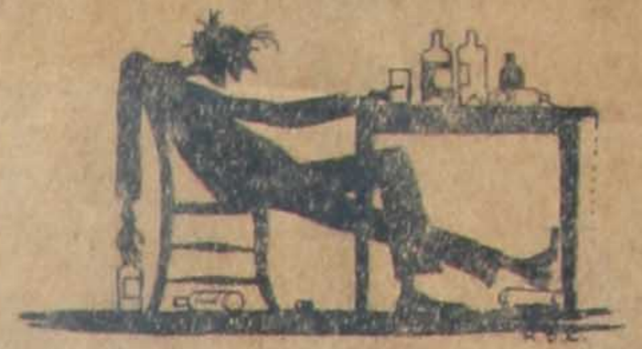
DITTO THE PROOF-READER