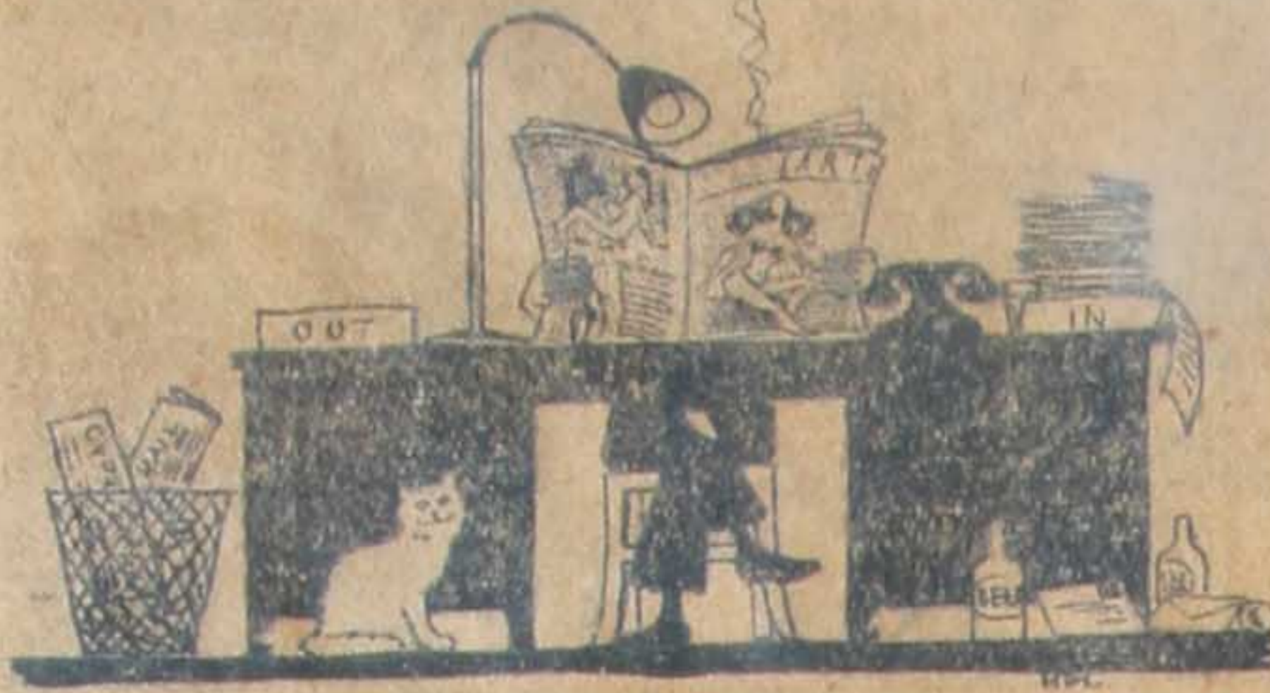
THE EDITOR AT WORK