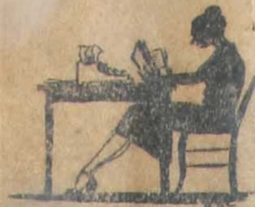
DITTO THE SECRETARY