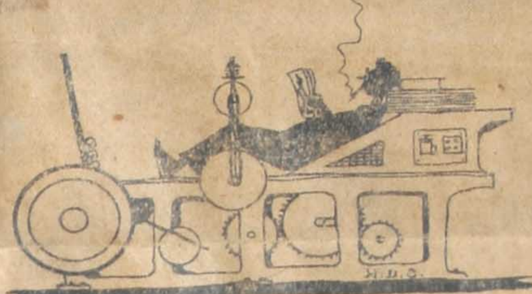
DITTO THE MACHINE MINDER