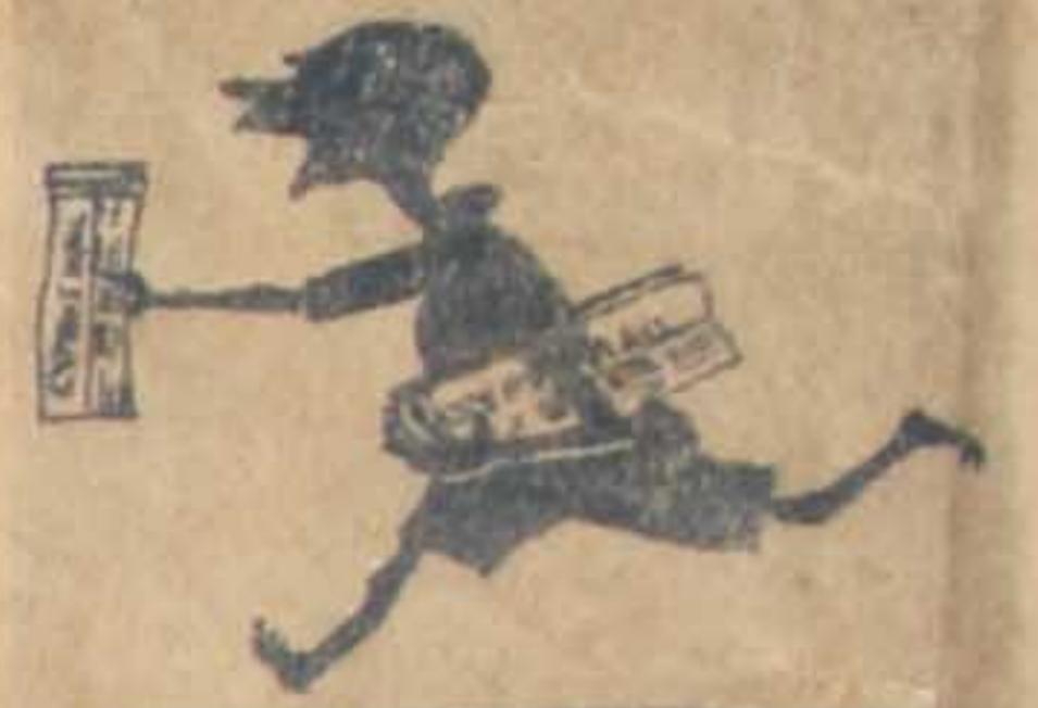
DITTO THE NEWSBOY