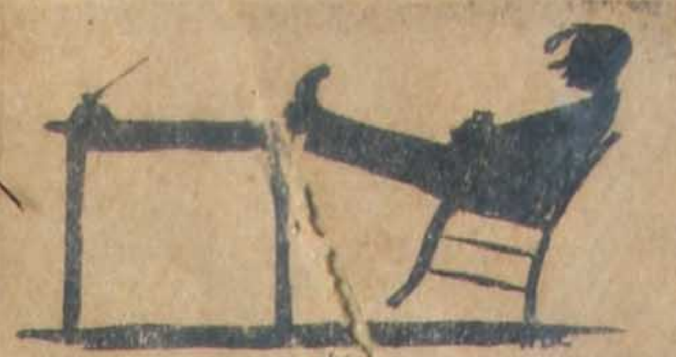
DITTO THE STAFF REPORTER